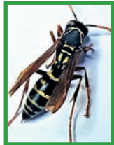
Asian paper wasp