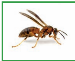
Native paper wasp