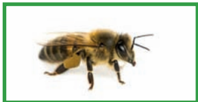
European honey bee